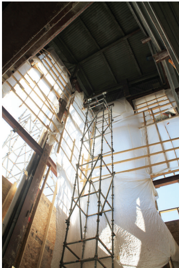
Demolition: New stairwell space to accommodate open, multiple-level staircase flanked by iconic arched windows

The Arlington Public Schools (APS) comprehensive whole building transformation of the Education Center on North Quincy Street in Arlington Virginia is taking shape. This new wing increases the capacity of Washington-Liberty High School for 500 to 600 new high school students, and enables adaptations for future instructional and grade level changes. We are also completing renovation work in the original David M. Brown Planetarium - the domed astronomy facility which hosts projection movies and features public lectures and shows - that involves minor abatement, new walls and floor finishes.