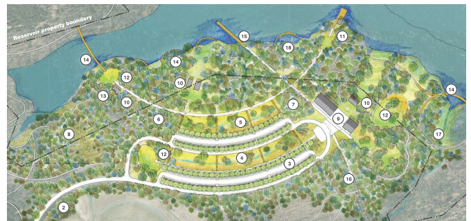
Beaverdam Reservoir park illustration

This project is in association with landscape architects Nelson Byrd Wolz