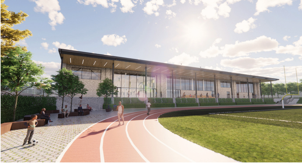
Rendering - new high school field, rear view