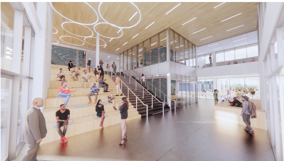
Rendering - high school lobby

The Studio Twenty Seven Architecture newsletter is a quarterly digital publication featuring key projects, architects, news and ideas.