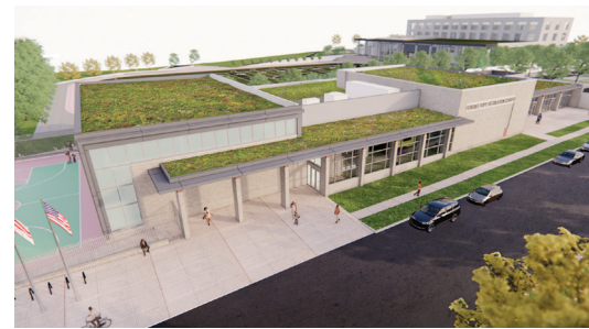
Top, aerial rendering of Ferebee-Hope site Above, new Recreation Center Below, new recreation center indoor basketball court