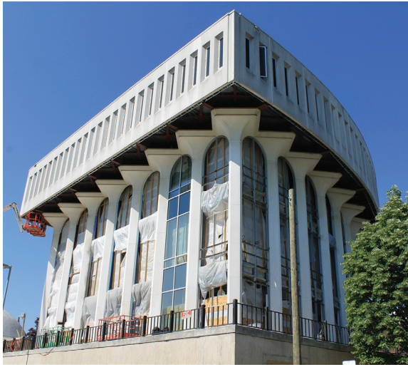
Iconic Ed Center on N. Quincy Street, Arlington VA

The Arlington Public Schools (APS) comprehensive whole building transformation of the Education Center on North Quincy Street in Arlington Virginia is taking shape. This new wing increases the capacity of Washington-Liberty High School for 500 to 600 new high school students, and enables adaptations for future instructional and grade level changes. We are also completing renovation work in the original David M. Brown Planetarium - the domed astronomy facility which hosts projection movies and features public lectures and shows - that involves minor abatement, new walls and floor finishes.