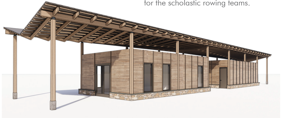
Welcome center pavilion

The new 71-acre park plan was approved by Loudoun County Board of Supervisors in 2019. The scope of the development plan includes new hiking trails, boardwalks, a main pavilion, boat storage and docks on the water. Our work includes the welcome center (below), 4 picnic pavilions, kayak rental kiosk, and the new crew storage facility for the scholastic rowing teams.